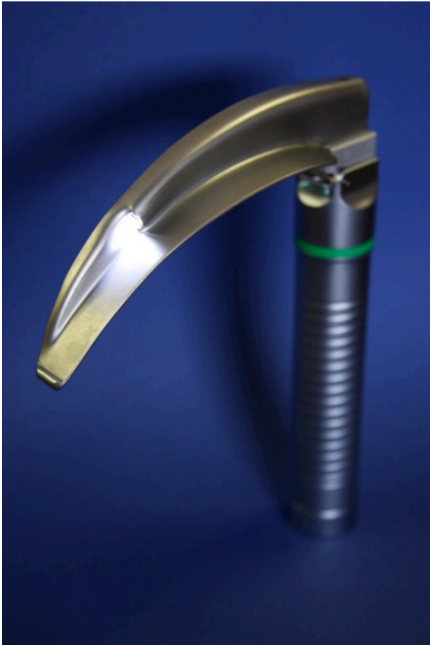
Super LED Laryngoscope Medium Handle